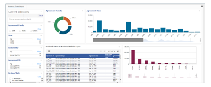
Summary Terms Report